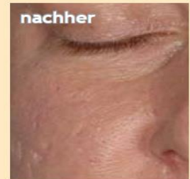
3D Aufnahmen der Hautporen